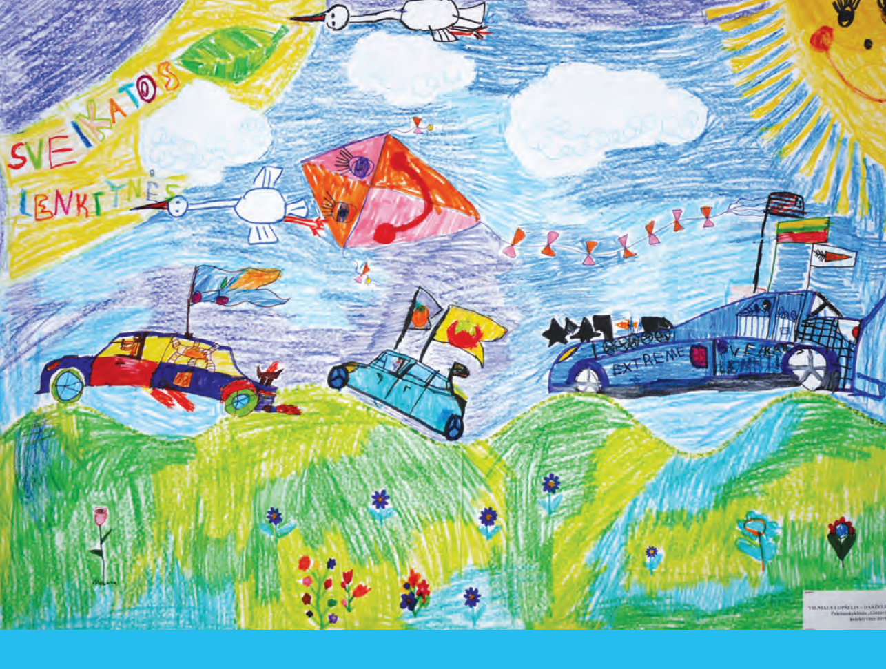
ANNEX 2: ABOUT THE YOUNG PEOPLE'S WORKSHOP AS PART OF THE CONFERENCE