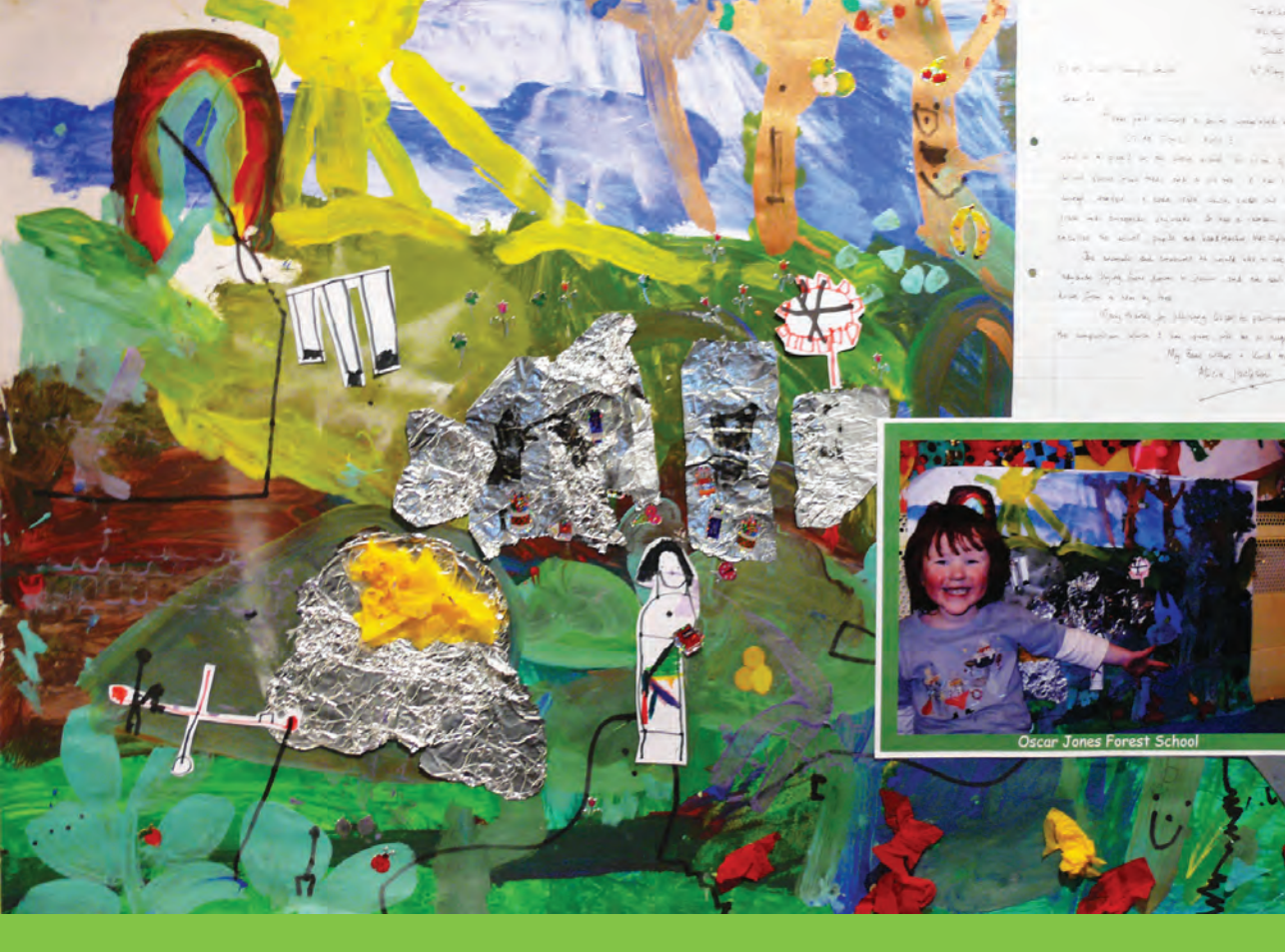
CHAPTER 6: TOPICS IN SCHOOL HEALTH PROMOTION