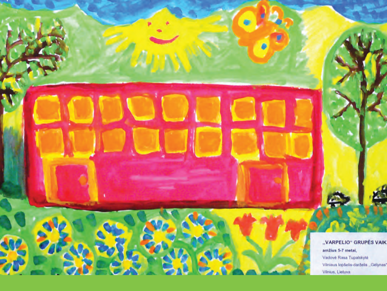
CHAPTER 1: WHOLE SCHOOL APPROACH