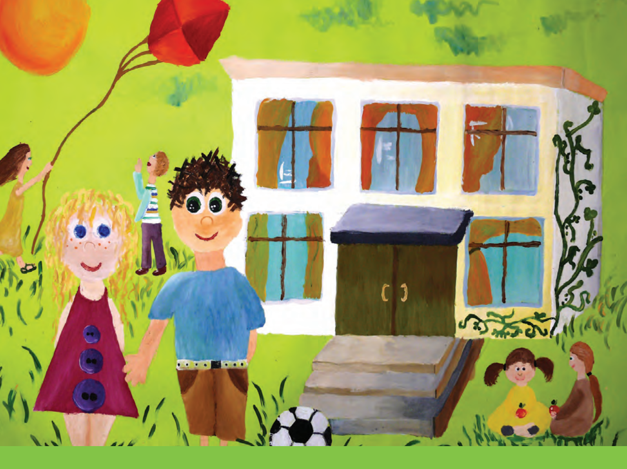
CHAPTER 4: BUILDING CAPACITIES