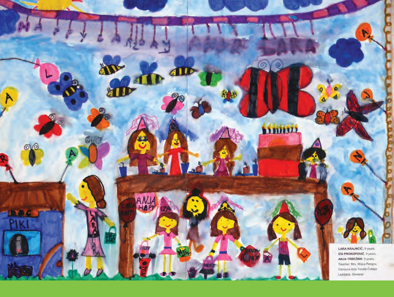
CHAPTER 5: SCHOOL AND THE COMMUNITY