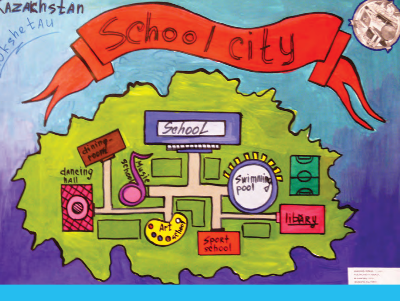
ANNEX 1: ABOUT THE VILNIUS CONFERENCE