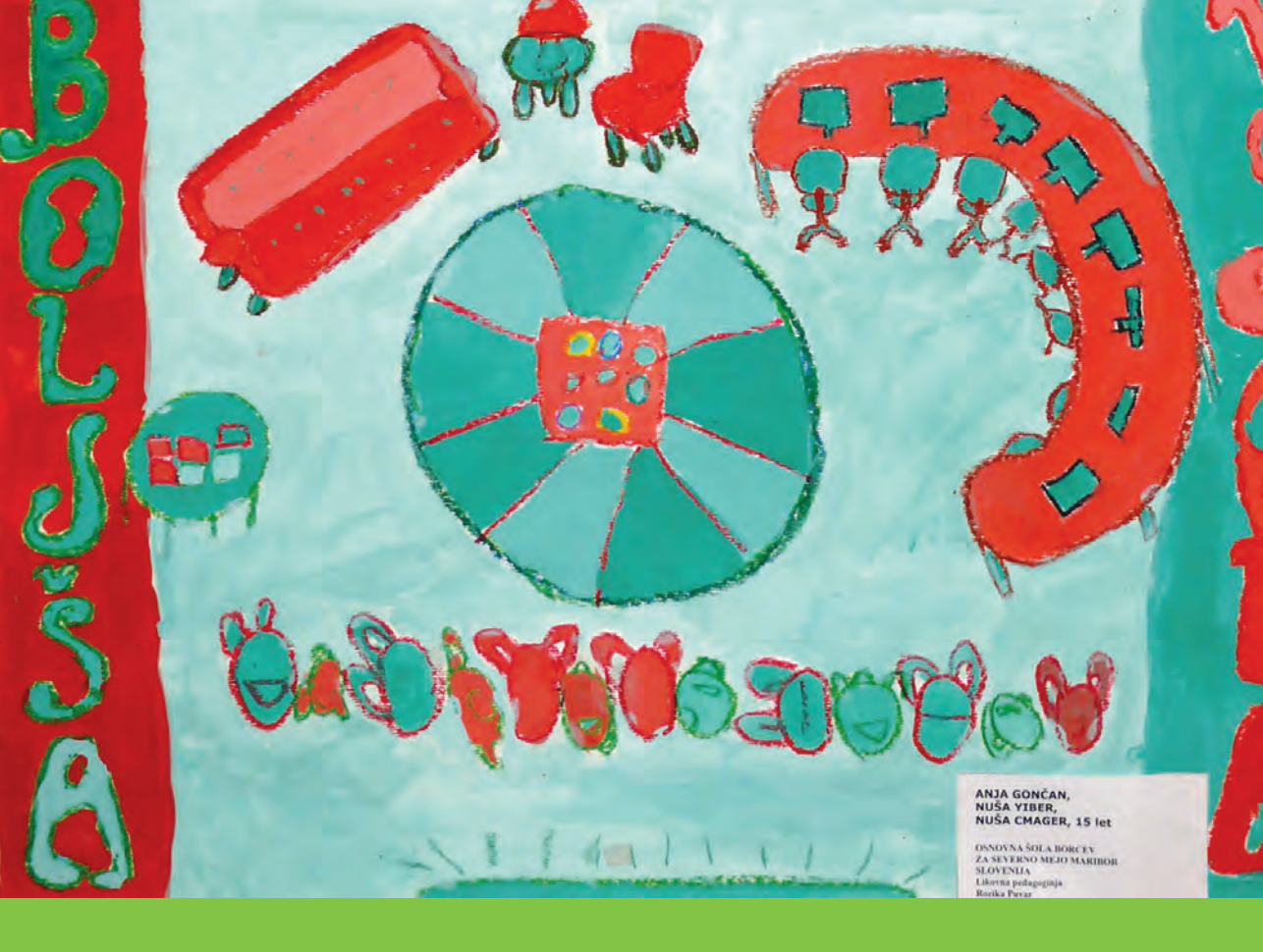
CHAPTER 3: FOCUSING ON PROCESSES OF CHANGE