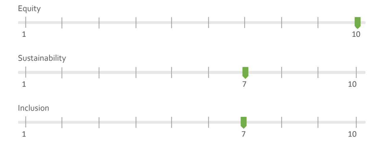
Figure 1. Generalization of the representation of the SHE-core values in schools in Austria

The formal HPS approach is based on the core values equity, sustainability, inclusion, empowerment and democracy. Figure 1 shows the SHE national coordinator's estimation of how much the SHE-core values<sup>4</sup> in schools in Austria are reflected on a scale from 1 (not reflected at all) to 10 (reflection to the highest degree). The score for all values are higher than 7.