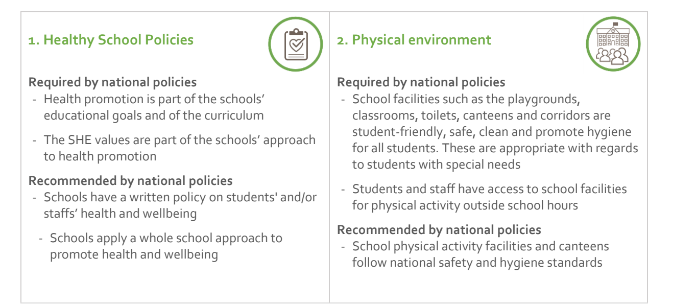
Table 2. The implementation of the Health Promoting School components in Austria

Table 2 shows the implementation of the HPS components in schools in Austria. It shows that components 1 to 4 are all required and/or recommended by national policies. Further, a combination of measures enhances the link between schools and community stakeholders (component 5) and with local and regional health services (component 6) in the majority of schools in the country.