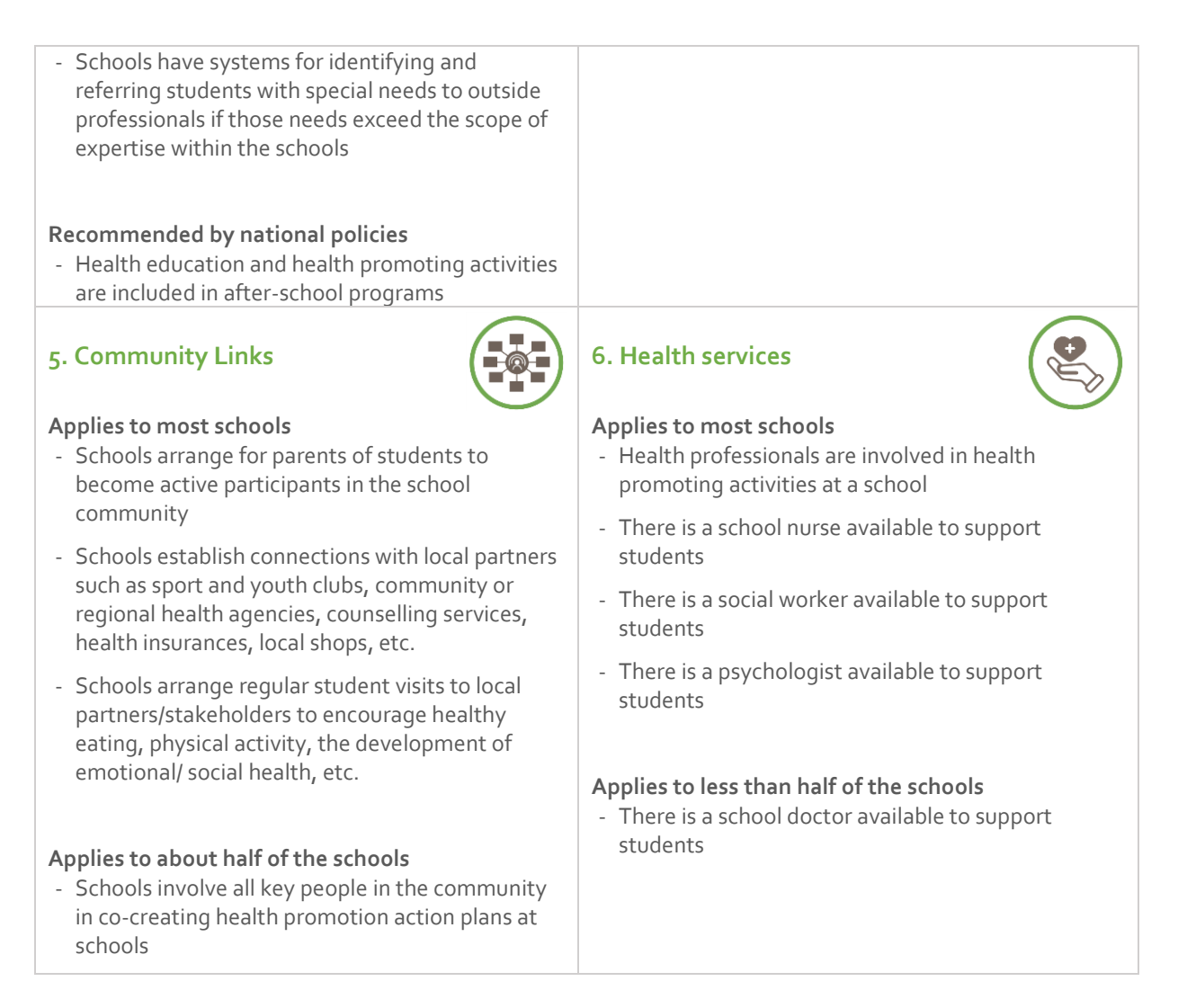
Table 2. continued